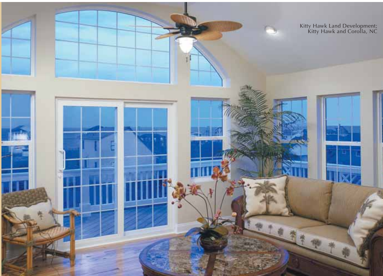
Kitty Hawk Land Development; Kitty Hawk and Corolla, NC

WinGuard with vinyl frames has Florida State Product Approval, meets or exceeds the International Building Codes and AAMA/NWWDA specifications, and passes ASTM E1886/E1996 for both small and large missile impact protection. Laminated insulating glass comes standard with our vinyl frames.